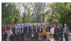
2017. 5.10-12, Budapest, Hungary