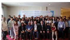
2019.5.27-29, Bali, Indonesia